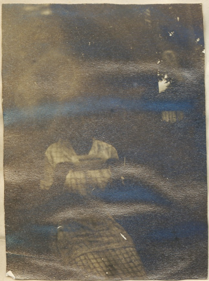
Happy - just rec'd a check!!!