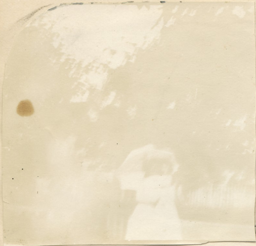
at Aunt Mammie's gate.