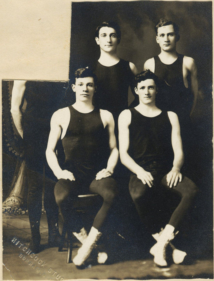
All that is left of Dick!"