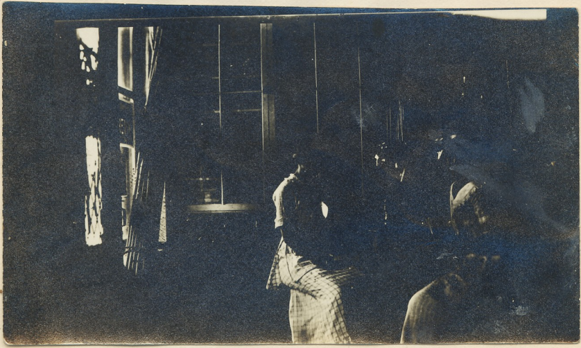
Have one on me!!